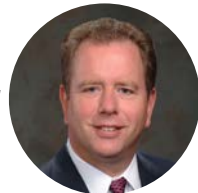
KURT KUCK KUKA Assembly and Test Corp.