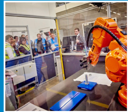
KUKA Assembly and Test Corp.