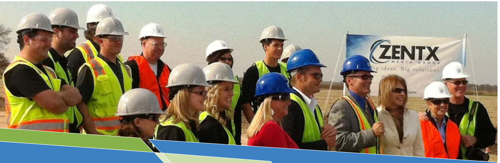
Above -ZENTX Media Group recently held a ground breaking ceremony for its new 12,000 sq. ft. facility, which will be located on W. Freeland Rd., adjacent to the MBS International Airport.