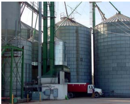
Freeland Bean and Grain Inc.'s headquarters and main facility is located at 1000 E. Washington Rd. in Tittabawassee Township.

The Solar Technology Park is located at 705 N. Graham Rd. (M-52) just northwest of the M-46 and M-52 intersection, 12 miles from I-75, 13.5 miles from MBS International Airport and will soon have complete infrastructure in place. The Park has the potential to locate up to six solar manufacturing facilities that would create hundreds of direct and indirect jobs, along with millions of dollars in new investment and new tax base.