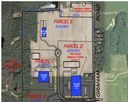
The Great Lakes Solar Technology Park is located at 705 N. Graham Rd. (M-52) just northwest of the M-46 and M-52 intersection in Thomas Township.