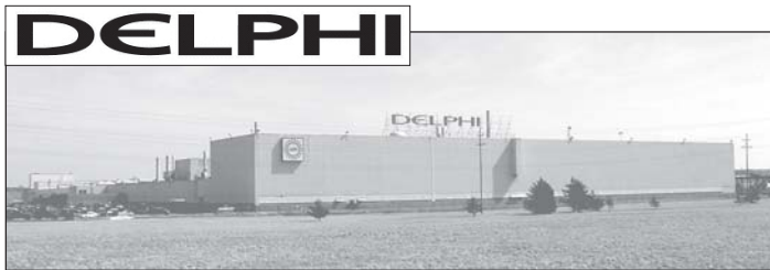
Delphi Steering is located in Buena Vista Charter Township.

The Delphi Corporation plans to invest nearly $100 million in its steering facility in Buena Vista Charter Township. The investment will improve existing processes and allow for the implementation of new technology.