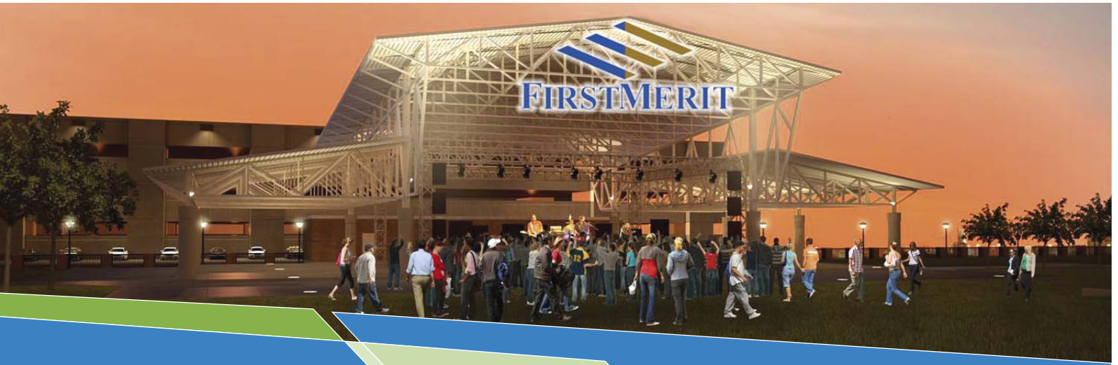
Above - Rendering of the outdoor FirstMerit Event Park that is being developed adjacent to TheDow Event Center in Downtown Saginaw.