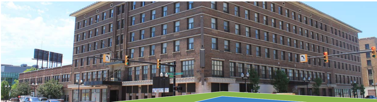
Above - The Bancroft Building is located at 107 S. Washington Ave. in Downtown Saginaw.