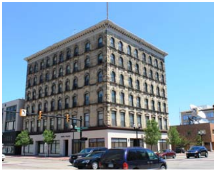
The Eddy Building is located at 100 N. Washington Ave. in Downtown Saginaw.