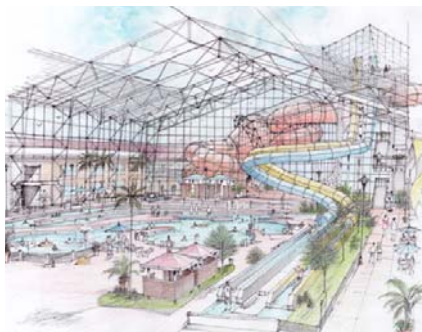
Zehnder's Splash Village and Waterpark expansion interior sketch. Splash Village is located at 1365 S. Main St. in the City of Frankenmuth.