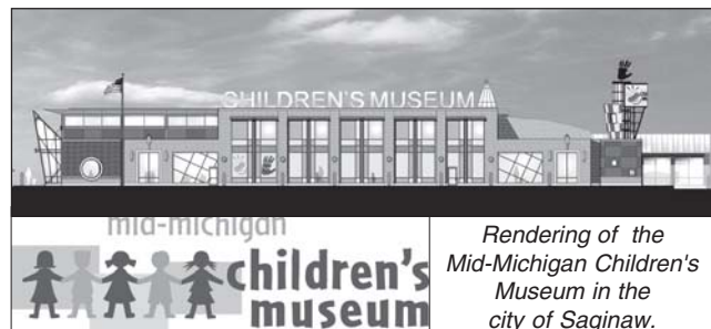
Rendering of the Mid-Michigan Children's Museum in the city of Saginaw.

Museum organizers have stressed that this is a regional project developed for and by Bay, Midland and Saginaw Counties. Midland's