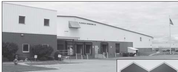
Plastatech Engineering is located on 725 E. Morley Dr. in Buena Vista Charter Township.

Plastatech Engineering Ltd. is making major capital improvements at its Buena Vista Charter Township facility. The project will include the expansion of its facility and the purchase of new equipment.