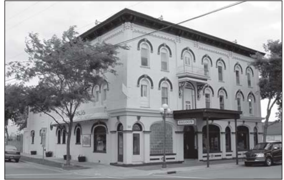
Perry's Schuch Hotel is located on 301 N. Hamilton St. in Old Saginaw City.