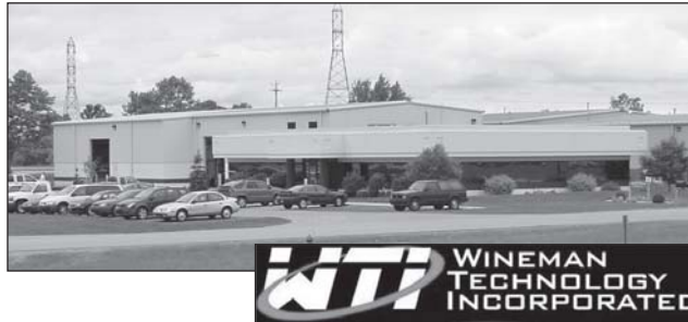
Wineman Technology Inc. is located on 1668 Champagne Drive, N. in Saginaw Township.

This expansion will allow WTI to continually increase capacity in order to better meet the growing needs of its customers.