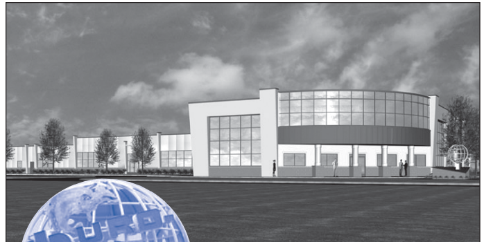
Rendering of Duro-Last Roofing, Inc.'s office renovation and expansion project in Buena Vista Charter Township.

The addition and renovations will also more professionally accommodate the numerous plant