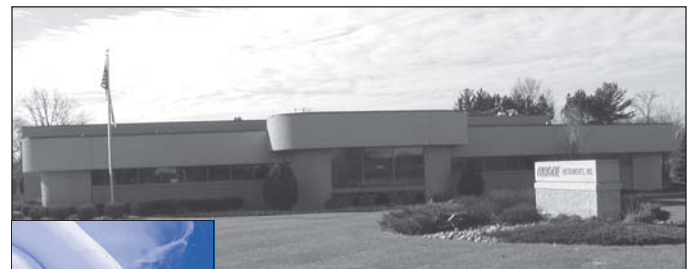
Unique Instruments, Inc. is located on 6688 Dixie Highway in Bridgeport Charter Township.

Unique Instruments, established in 1977, plans to add 45,000 sq. ft. to its facility, which will more than double its size.