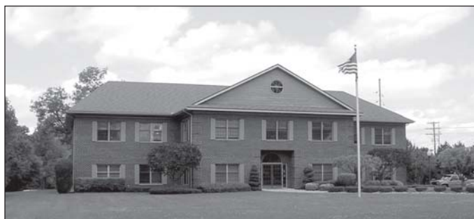
K&K Technology is located in the William A. Kibbe & Associates building on 1475 S. Washington Ave. in the City of Saginaw.

In order to attain working capital to sustain this new development, K&K Technology received a loan from the East Central Michigan Revolving Loan Fund (ECMRLF), which provides low interest gap financing for small- to medium-size companies. East Central