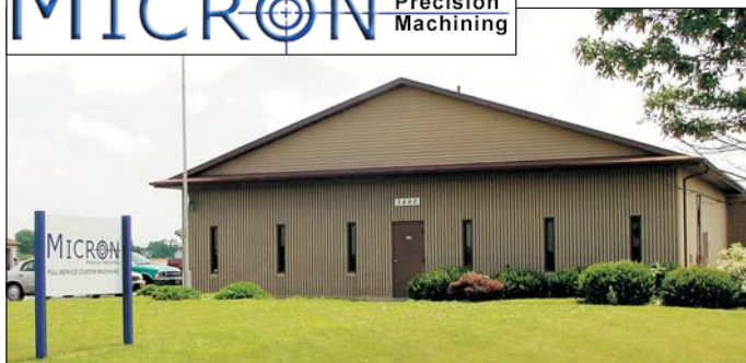
Micron Precision Machining is located on 3860 E. Washington Road in Buena Vista Charter Township.