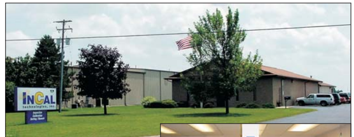
InCal Technologies is located on 3870 E. Washington Road in Buena Vista Charter Township.