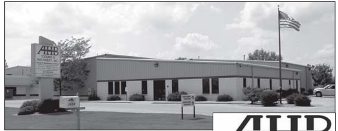
AHB Tooling & Machinery, Inc. is located at 1658 Champagne Drive North in Kochville Township.

AHB Tooling & Machinery was founded in 1995 and since 2002 has added new product lines such as Mitsubishi Carbide, Blaser Swisslube Coolant band saws and Wilton mills and lathes. The company employs approximately 20 people and gross sales are expected to grow at 15% to 20% per year as AHB focuses its sales efforts on the southeastern and middle portions of Michigan.