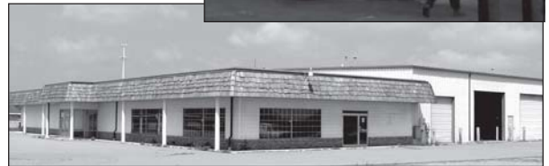
Rigger Lift by Klassic's new location is in the former Heritage Manufacturing facility on M-57 in Chesaning Township.