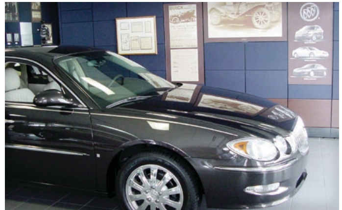
Garber Buick, a $6.2 million flagship facility, is located at 5925 State St. in Saginaw Charter Township.