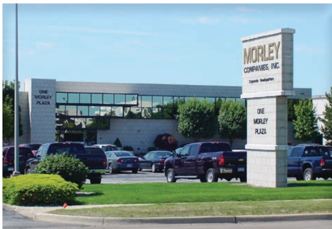
Morley Companies, Inc. is located at One Morley Plaza in Saginaw Charter Township.