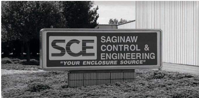
Saginaw Control & Engineering, Inc. is located at 95 Midland Rd. in Saginaw Charter Township

Saginaw Control & Engineering (SCE) will add at least four jobs to its ranks upon the installation of a $430,000 welding machine.