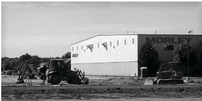
Construction at Morley Companies has already started.

The 32,750 sq. ft. facility will house a call center and a training area, where employees provide data collection and market research, along with call center services. Morley has two existing office buildings and a warehouse on the site.