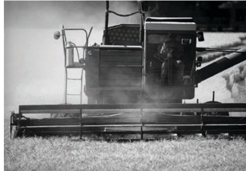
Star of the West Milling Co. headquarters are located at 121 E. Tuscola St. in the City of Frankenmuth.

Star of the West Milling provides drying, processing and storing of grains. The company is expanding and refurbishing its City of Frankenmuth headquarters with a total investment of $3.7 million.