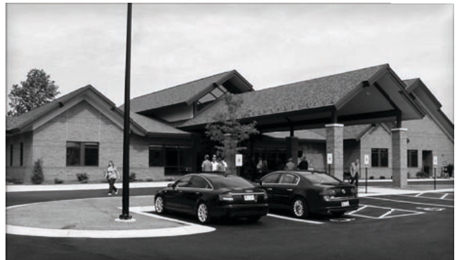
Saginaw Valley HealthCare is located at 2970 Pierce Road on the campus of Saginaw Valley State University.

Saginaw Valley HealthCare includes a MedExpress urgent care facility, family practice office and lab, and X-ray services. The facility is open Monday through Saturday from 8 am - 8 pm and Sunday from 9 am - 6 pm. In addition to the service delivery benefits, the facility also will serve as a "learning laboratory" where SVSU students in the College of Health and Human Services will be able to gain valuable clinical experience.