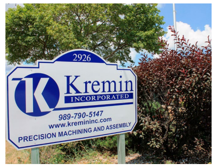
Kremin, Inc.'s Saginaw Charter Township facility is located at 2926 Universal Dr.