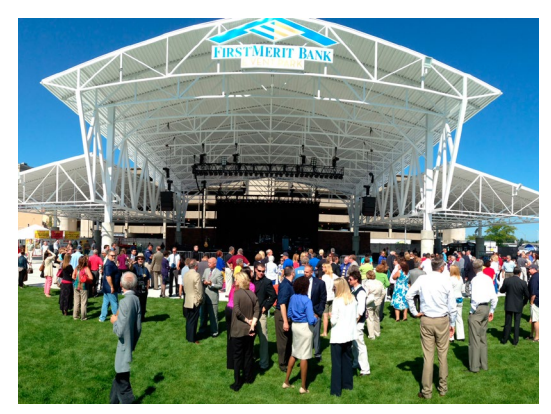
The FirstMerit Bank Event Park is located at 300 Johnson St. across from TheDow Event Center in Downtown Saginaw.

The FirstMerit Bank Event Park recently held a ribbon cutting ceremony, which was quickly followed by two successful events - the Michigan Rock 'n Rib Fest and Saginaw Wonderfest. The 5,500-seat Event Park provides both pavilion and lawn seating and will feature the upcoming Fall In for Arts and Sol on September 28th.Acting on a request from the County of Saginaw, SFI continues to assist the Building Authority and TheDow Event Center (SMG staff) to secure final funding in support of the project. SMG will manage the venue and be responsible for booking, planning, marketing and facility maintenance.