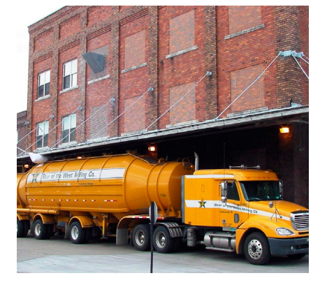
Star of the West's Gera facility is located at 2416 S. Gera Road in Frankenmuth Township.

Star of the West Milling Company made a $1.2 million investment in new storage facilities at its Frankenmuth Township location. The company has expanded the storage facilities several times over the past few years including a $2.2 million investment in 2008, and $705,000 in 2009. The corporate office in the City of Frankenmuth also grew and was renovated in 2009 and 2010, which eventually totaled over $5.5 million in improvements. The company's overall daily flour milling capacity makes it the 17th largest miller in the U.S. One of its major clients is the nationally known Kellogg's cereal company of Battle Creek.