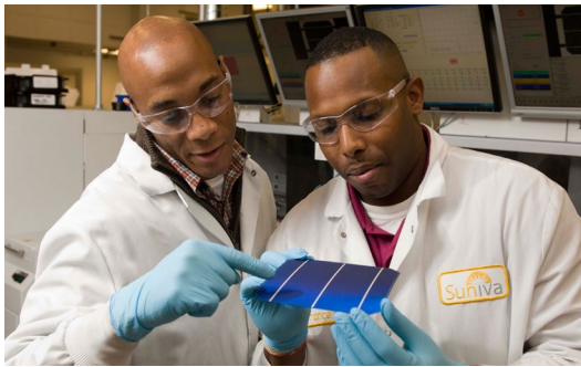
Suniva, Inc. is opening a second U.S. manufacturing facility, which will be located at 2650 Schust in Saginaw Charter Township.