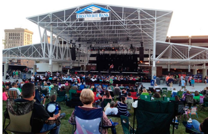
The FirstMerit Bank Event Park is located at 300 Johnson St. in Downtown Saginaw.