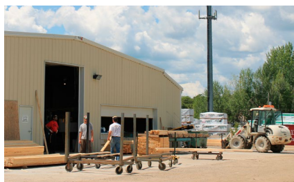
Mid Michigan Truss & Components LLC is located at 2795 Harrison St. in Carrollton Township.

T.M. Klein & Sons Honey and Containers is constructing a new 5,000 sq. ft. building and adding new equipment. The honey producer has experienced increased customer demand for its products and is seeking to expand jar sales to markets in Indiana, Ohio, and Michigan. T.M. Klein currently employs 18 people and expects to add five more jobs. SFI assisted the company with the Pure Michigan Economic Gardening program, which provides fast, targeted, sophisticated technical research for qualified second-stage growth companies with the capacity to grow its business.