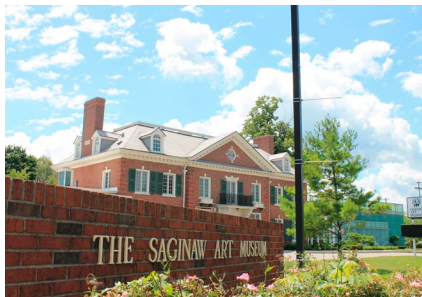
The Saginaw Art Museum is located at 1126 N. Michigan Ave. in the City of Saginaw.