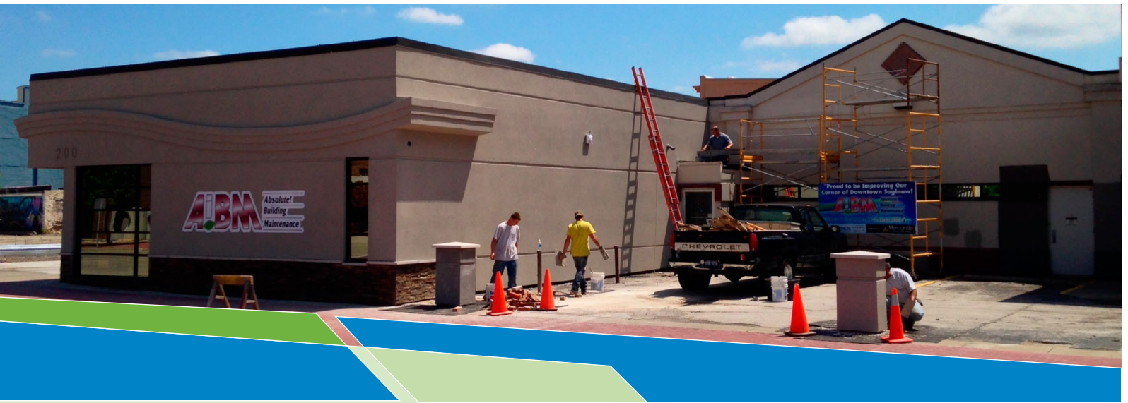
Construction workers put the final touches on facade renovations for Absolute! Building Maintenance located at 200 S. Washington Ave. in Downtown Saginaw.