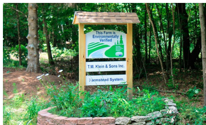
T.M. Klein & Sons Honey and Containers is located at 11785 Wahl Rd. in the Village of St. Charles.