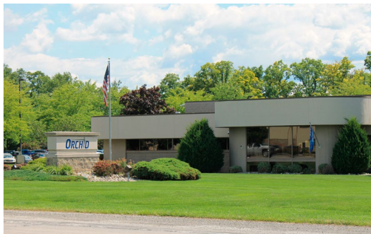
Orchid Bridgeport is located at 6688 Dixie Hwy. in Bridgeport Charter Township.

Orchid provides expertise to partners in more than 20 countries with a wide-ranging offer, from design and development through finished goods manufacturing. Orchid Bridgeport can assist with a fast launch of precision-perfect surgical cutting accessories, instruments and implants. Saginaw Future assisted the company and the Bridgeport community with a tax incentive.