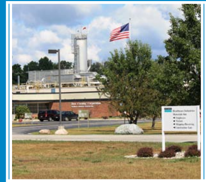
Dow Corning Healthcare Industries Materials Site