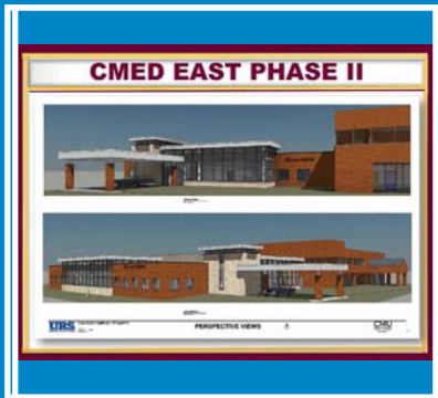
CMU College of Medicine St. Mary's of Michigan