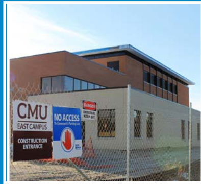
CMU College of Medicine Covenant HealthCare