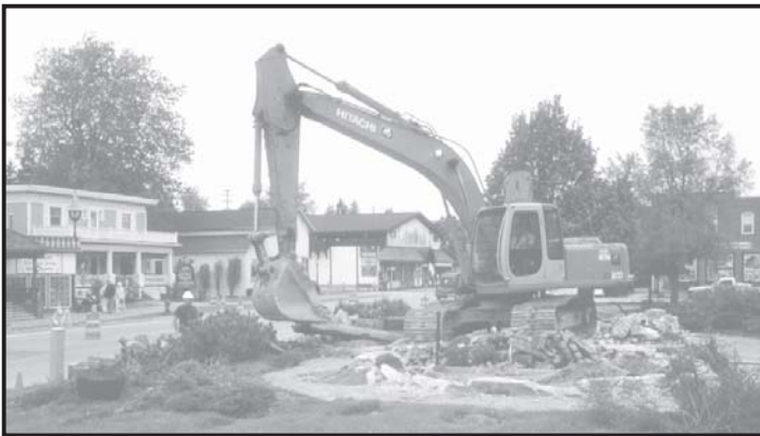
Construction work at the Visitor Center Platz!

The goal of the project is to expand pedestrian walkways along Frankenmuth's Main Street. CDBG funds were focused on improvements at the Frankenmuth Visitors Center Platz and the Gunzehnhause Platz — both on Main Street. At the Visitor Center Platz, improvements include new benches, trash receptacles, lighting and landscaping. The Gunzehnhause Platz, located across the street and one block south of the Visitor Center Platz, will be expanded to accommodate a greater number of visitors along the corridor. In addition, realignment of the traffic patterns near this platz will improve vehicle and pedestrian safety, supporting easier and more direct access to Zehnder's Restaurant.