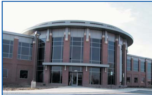
BRAUN KENDRICK FINKBEINER LLC NEW OFFICE BUILDING