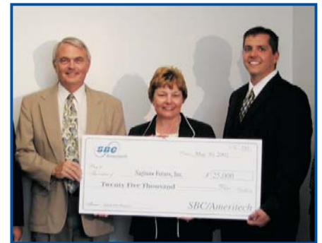
SBC AWARDS SAGINAW FUTURE $25,000 GRANT

IN 2002, SFI HELPED COMPANIES EXPAND AND INVEST OVER $251 MILLION IN SAGINAW COUNTY!