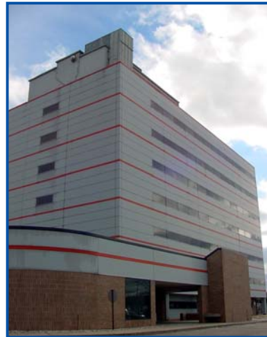
Saginaw Tower at 515 N. Washington Ave.

In return, the city turned over ownership of the Saginaw Tower on N. Washington Ave. to SSP for a nominal fee, and also approved 15-year state renaissance