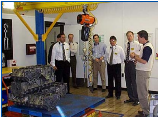
GM INVESTS $88 MILLION