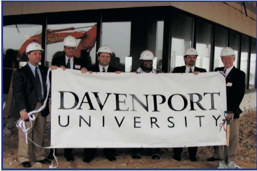
DAVENPORT UNIVERSITY BUILDS NEW CAMPUS