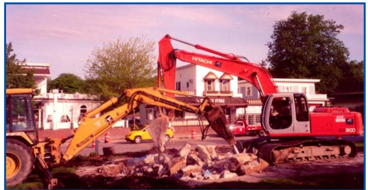
FRANKENMUTH STREETSCAPE INVESTMENT