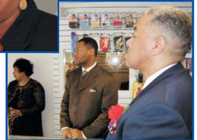
MAYOR WILMER JONES-HAM SPOKE AT WONDERLAND BEAUTY & BARBER SUPPLY'S GRAND OPENING