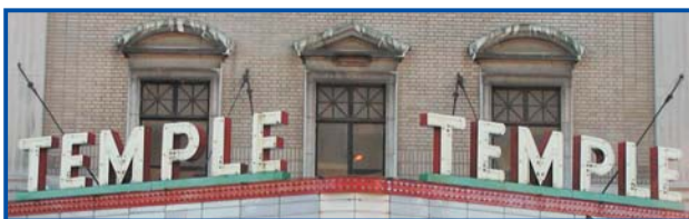
Temple Theatre at 201 N. Washington Ave.