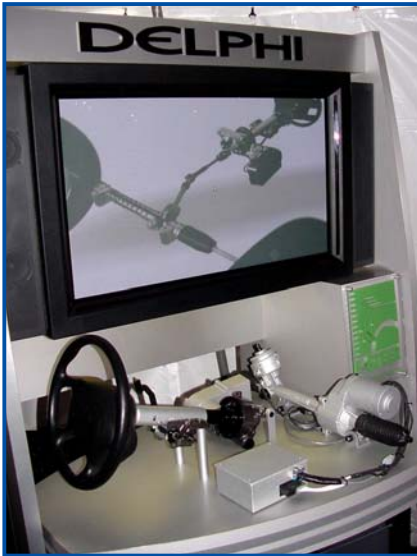
DELPHI LAUNCHES E-STEER