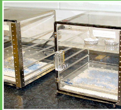
Dow Healthcare Industries Materials Site (HIMS)