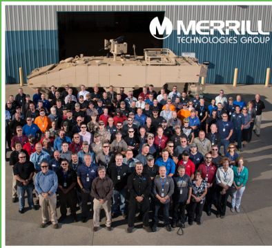
Merrill Technologies Group