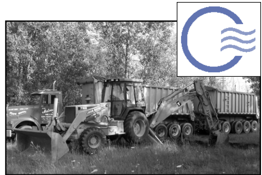
Preparation of Cinderella's new warehouse began in early September.

The multi-million dollar investment, which includes renovations, new construction and equipment, will result in a total of 150,000 sq. ft. of warehouse and office space.