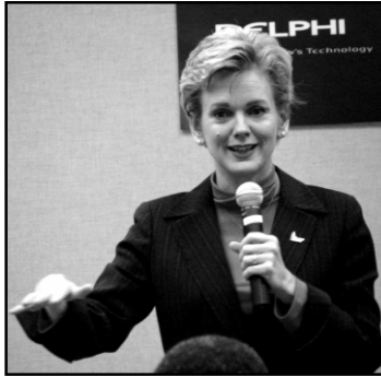
Governor Jennifer M. Granholm spoke at Delphi Saginaw.

The meeting was one of many planned discussions leading to a Manufacturing Matters summit the Governor will convene with business, labor, and economic leaders later this year. Granholm outlined her manufacturing initiative and opened the floor to general discussion. A four-member panel that included Delphi, Michigan Economic Development Corporation, United Auto Workers and Saginaw Future, joined the Governor to address questions on their organizations' role in the ongoing success of Delphi Saginaw.