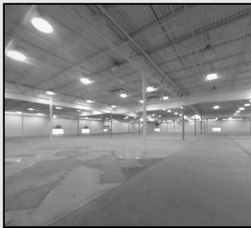
Former Builder's Square on 3175 Westbay, 109,800 sq. ft.

In 2002, Saginaw Future received a high-tech Excelerator grant from SBC to produce 360 degree Virtual Property Tours. The property tours allow Internet computer users to virtually explore the interior of buildings for sale or lease.