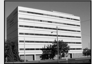
Saginaw Tower on 515 N. Washington Ave.

Saginaw Future Inc. will be moving to the Saginaw Tower on 515 N. Washington Ave., across from the Saginaw County Event Center.