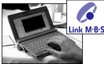
New wireless Internet technology.

Recommendations on how the tri-county region can leverage its Internet infrastructure and knowledge base to gain competitive advantages were the focus of discussion. The entire tri-county broadband study can be accessed at www.linkmbs.org