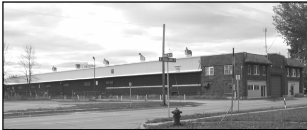
IQC's proposed expansion on E. Holland Ave. in Saginaw.

International Quality Control (IQC) is a relatively new company, which began operations in 2001. Its initial success has led to a recent expansion. IQC is continuing to expand and is in the process of