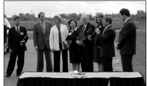
State and local leaders celebrate the opening of Dow Corning's Advanced Engineering Materials division.

Dow Corning Corporation recently celebrated the opening of its new Advanced Engineering Materials division. The 30,000 sq. ft. addition to its existing facility in Bay County's Williams Township is a $22 million investment.