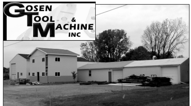
Gosen Tool & Machine Inc. is located at 2054 Brettrager in Spaulding Township.

Gosen Tool serves a wide region and its primary business is the manufacture of tools, fixtures, machine components, proto-type and build assemblies. It offers complete machining as well as welding fabrication capabilities. SFI assisted the company and the community with site location incentives.