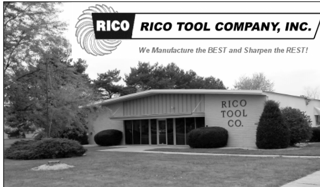
Rico Tool Company, Inc. is located on 4450 Marlea Drive in Bridgeport Township.

to-order tooling with one to two-day delivery in many cases.