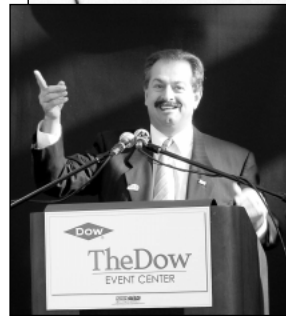
Andrew Liveris, Dow president and CEO, officially renames The Dow Event Center.