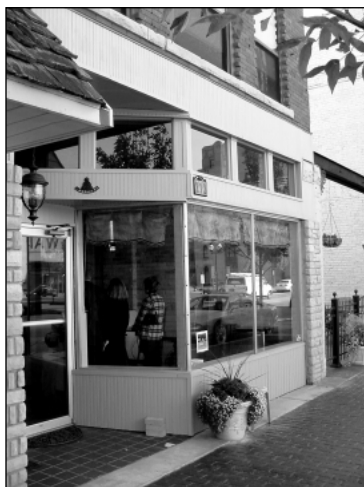
Future home of the Glen Rowan Estate Coffee Shop and Salzburg Winery.