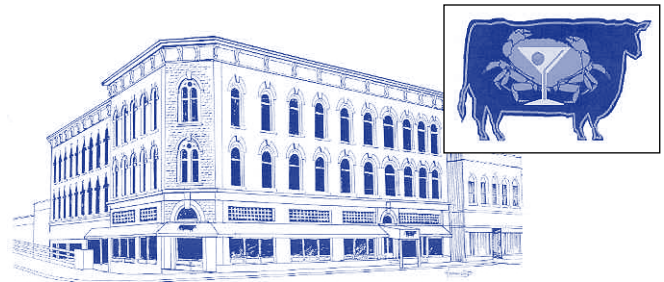
Future site of Old City Grill on S. Hamilton Street in Saginaw.