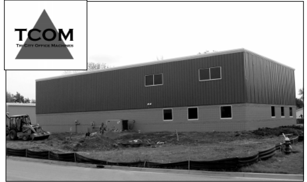
Tri-City Office Machines' new facility is located at 929 Bridgeview South in the city of Zilwaukee's Bridgeview Center Industrial Park.

Tri-City Office was also recently named as one of the country's Elite Dealers by OfficeDEALER magazine. The award is presented annually by the magazine to the top office equipment, office products, and office furniture dealers in the United States.