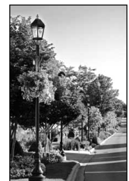
Frankenmuth Streetscape cover photo from Landscape Architect Magazine .

The city of Frankenmuth's new streetscape was featured in the 2004 August edition of Landscape Architect and Specifier News , a national industry magazine for commercial landscape specifiers. Frankenmuth's streetscape was the cover story and included numerous full color photographs of the successful tourist project.