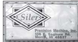
Siler Precision Machine, Inc. is located at 136 East Saginaw Road in the Village of Merrill.