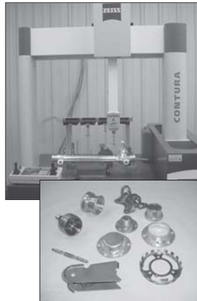
Ranger Tool & Die Co. is located at 317 S. Westervelt in the City of Zilwaukee.

Ranger Tool provides a range of machining services including: turning, two through five axis milling, RAM and wire EDM, contouring, drilling, tapping and internal and external thread grinding. Heat treating and plating can also be provided the company's certified vendors.