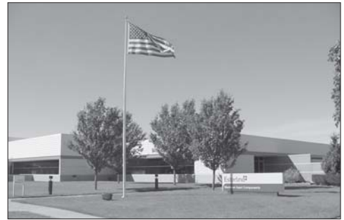
Memtron Input Components is located at 530 North Franklin Street in the City of Frankenmuth.

The Frankenmuth based company is a unit of the Interface Technologies Group of Esterline Corporation and employs approximately 100 people. Memtron leverages 30 years of interface expertise to implement fast-turn prototypes and designs for low-cost manufacturing. The 45,000 square foot manufacturing facility is ISO 9001 2000 certified and maintains a dock-to-stock supplier status.