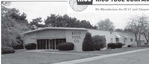
Rico Tool Company, Inc. is located at 4450 Marlea Drive in Bridgeport Charter Township.

Rico Tool Company, Inc. continues to invest in its future. The company recently purchased $110,000 in new machinery and is expected to add one employee as a result.