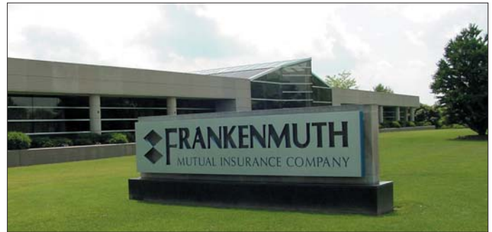
Frankenmuth Mutual Insurance Company headquarters are located at One Mutual Avenue in the City of Frankenmuth.

Frankenmuth Mutual Insurance is expanding its corporate headquarters by 47,000 square feet. The company is investing $10 million in the project, which is expected to create an initial 70 jobs with an estimated 130 more jobs to follow.