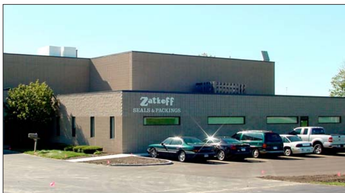
Zatkoff Seals & Packings is located at 5925 Sherman Rd. in the City of Zilwaukee's Bridgeview Center Industrial Park.