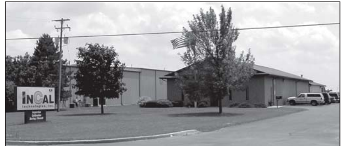
InCal Technologies is located on 3870 E. Washington Road in Buena Vista Charter Township.

InCal Technologies expanded for the third time over the past year at its recently opened location in Buena Vista Charter Township. The company invested nearly $190,000 in capital improvements and the addition of machinery.