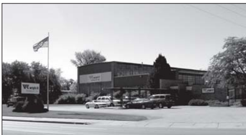
Wright-K Technology, Inc. is located at 2025 E. Genesee Ave. in the City of Saginaw.

Wright-K Technology, Inc. was established in 1982. The company is a designer, builder and rebuilder of special assembly, test, laser, welding and metal removal equipment. Wright-K also designs and builds prototypes and products, and provides personnel placement services.