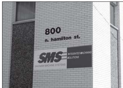
Saginaw Machine Systems is located at 800 N. Hamilton St. in the City of Saginaw.

Saginaw Machine Systems currently has 48 employees and is located in the City of Saginaw. The company is a designer and builder of standard and special machines, along with systems for metal cutting, die casting, leak testing and welding.