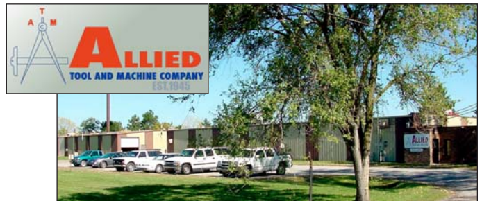
Allied Tool & Machine Co. is located at 3545 Janes St. in Buena Vista Charter Township.

Allied Tool & Machine Co., located in Buena Vista Charter Township, is expanding in order to meet increased orders and new contracts.