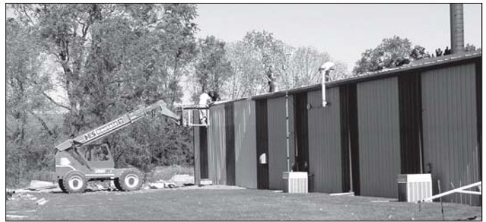
Allied Tool & Machine Co.'s expansion project included adding more manufacturing space.

Corporation, The Dow Chemical Company and Superior Industries. Allied Tool & Machine received the 1998 Quality Supplier of the Year from the Hemlock Semiconductor Corporation.