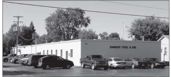
Ranger Tool & Die Co. is located at 317 S. Westervelt Rd. in the City of Zilwaukee.

The company is experienced in working with a wide variety of metals and plastics. Its Electronic Data Exchange system assists those who transfer data electronically and Ranger Tool has bar code capabilities.