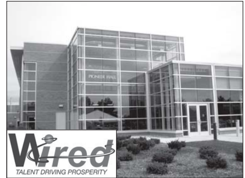
SVSU recently unveiled its renovated and expanded engineering building - Pioneer Hall.

Pioneer Hall's original 45,000 sq. ft. has been completely renovated with 30,000 sq. ft. being added. Funding for the project comes from the State of Michigan ($12 million) and SVSU ($4 million).