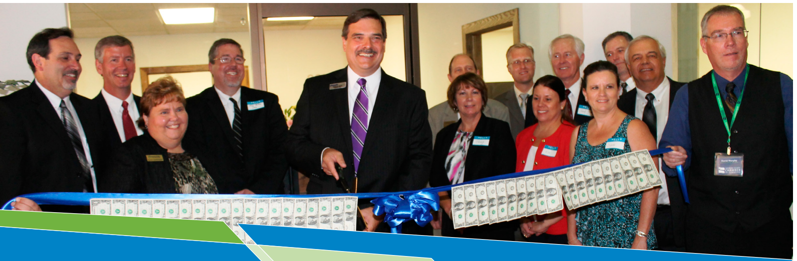
Community State Bank celebrates with a recent ribbon cutting at its new Downtown Saginaw offices.