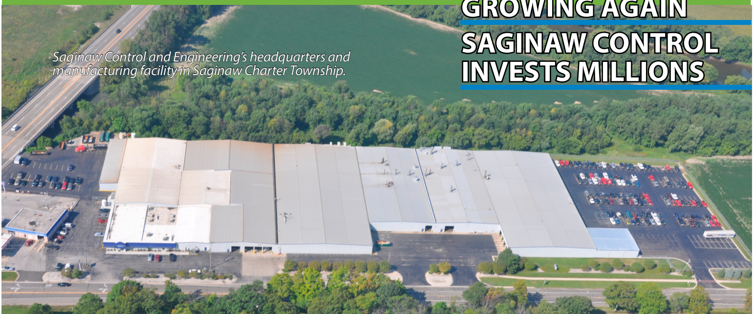
Saginaw Control and Engineering's headquarters and manufacturing facility in Saginaw Charter Township.