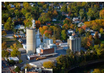
Star of the West's Frankenmuth facility is located at 121 East Tuscola in the City of Frankenmuth.

Saginaw Control & Engineering (SCE), located in Saginaw Charter Township, invested $6.7 million in major equipment purchases that will help meet growing demand for its products in the marketplace. SCE has been providing standard and custom enclosures for 50 years and has grown exponentially to its current size of 265,000 sq. ft. The company uses state-of-the-art fabrication equipment and the highest quality paint and powder finishes available today. SCE has distribution centers in Ohio, Wisconsin, Tennessee and Nevada providing the ability to deliver its over 2,000 parts to all 48 continental states.