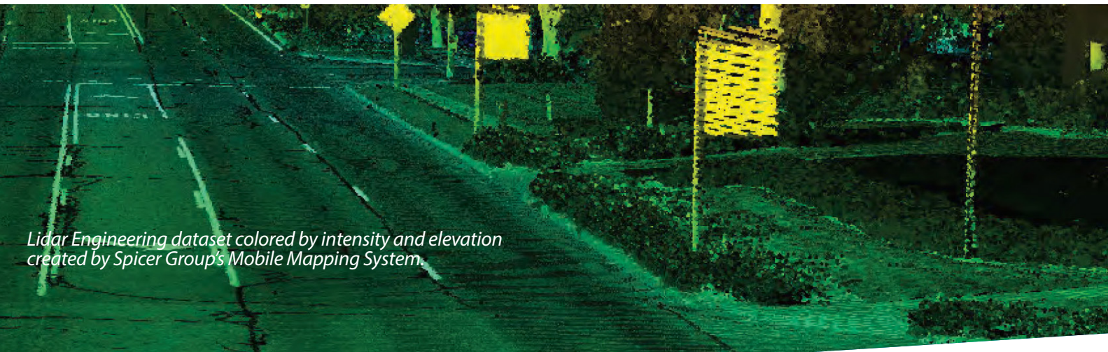
Lidar Engineering dataset colored by intensity and elevation created by Spicer Group's Mobile Mapping System.