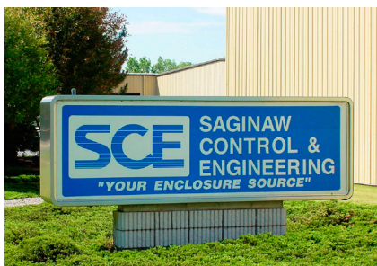
SCE's Corporate Office and manufacturing facility is located at 95 Midland Rd. in Saginaw Charter Township.