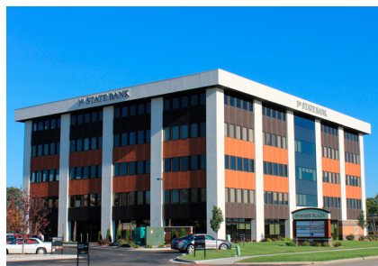
Rogers Mantese & Associates, P.C. is opening an office in the 1st State Bank Plaza.

Star of the West Milling Company is growing again and expects to begin construction of a new warehouse in the City of Frankenmuth later this year with completion in Spring 2014. The project's total investment is expected to be nearly $2 million with five jobs retained. SFI assisted both the company and the community form a new Industrial Development District as well as providing tax abatement application assistance. Star of the West made a $1.2 million investment in new storage facilities at its Frankenmuth Township location earlier in 2013. The company's overall daily flour milling capacity makes it the 17th largest miller in the U.S.