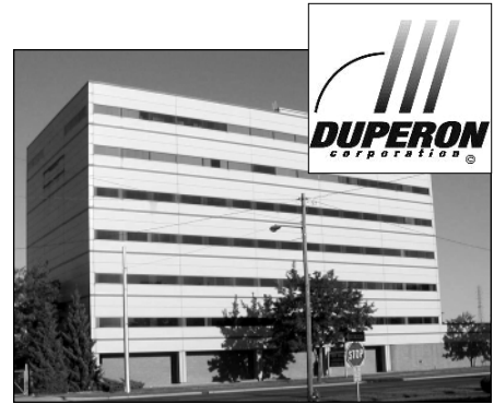
Saginaw Tower on 515 N. Washington Ave.