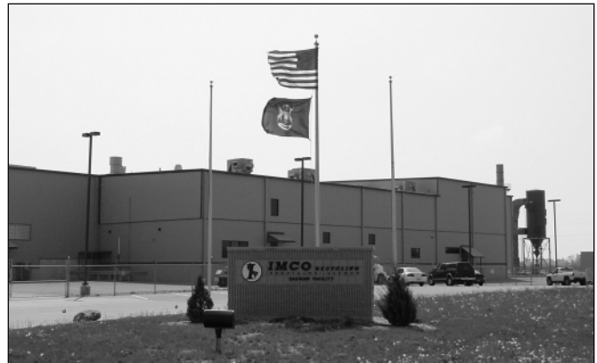
IMCO is a provider of recycled aluminum.

"IMCO's facility in Buena Vista Charter Township, near Interstate 75 and East Washington, will include a new molding furnace and