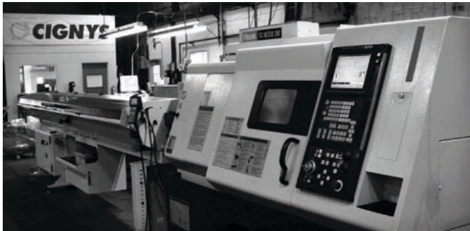
CIGNYS-Shields Facility is located at 1320 S. Graham Rd. in Thomas Township.