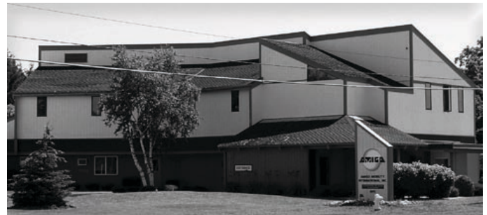
Amigo Mobility International, Inc. is located at 6693 Dixie Highway in Bridgeport Charter Township.

Amigo Mobility International, Inc. based in Bridgeport Charter Township, recently added 20,000 sq. ft. and new equipment. Amigo invested more than $750,000 and created six new jobs as a direct result of the expansion.