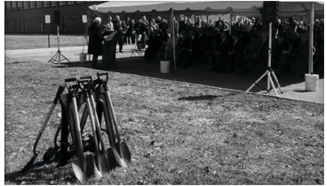
Students and community leaders gathered for the ground breaking of the new SVSU College of Nursing and Health Sciences building.

SFI, Saginaw County Chamber, area business and legislative leaders, and SVSU backers have supported the project for a number of years. The new facility will help meet the nursing demand, give opportunities for young people and support the Great Lakes Bay Region's medical facilities.