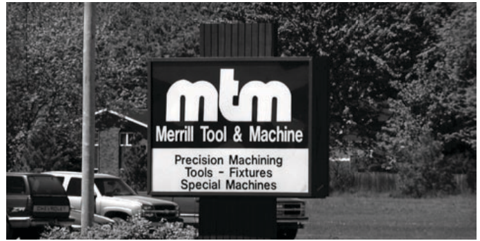
Merrill Tool & Machine, Inc. is located at 21659 W. Gratiot Rd. in the Village of Merrill.

Merrill Engineering & Integration (formerly Mer-ritech), is a machine build facility that was established in 1978 to expand in engineering and assembly.