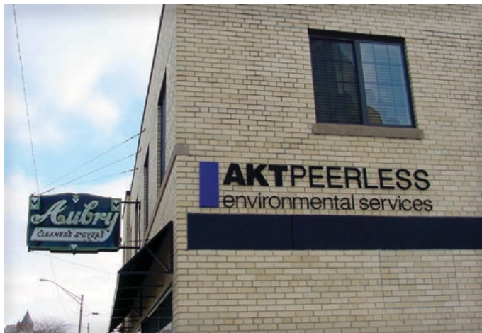
AKT Peerless Environmental Services, LLC Downtown Saginaw office is located at 214 Janes Ave., which was a designated Cool City Project.