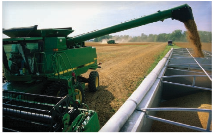
Star of the West Milling Co. headquarters are located at 121 E. Tuscola St. in the City of Frankenmuth.

Star of the West Milling Co. is expanding its Frankenmuth Township facilities, adding 312,000 bushels of additional storage and a grain dryer.