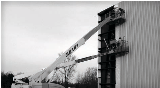
The Merrill Tool & Machine location expanded by 20,000 sq. ft. in 2005.

The company has expanded several times over the past five years and currently employs 450 people in the region. Officials anticipate hiring 10 more employees, because of the new investment.