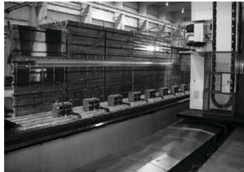
Merrill Aviation is located at 20720 E. Gratiot Rd. in Jonesfield Township.

Merrill Aviation is located in Jonesfield Township at the site of the original Merrill Tool facility. The company made real property improvements needed to reopen the facility and bring it up to grade necessary to do aviation work.