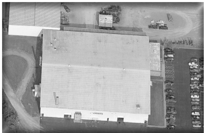
CIGNYS - Shields Facility is located at 1320 S. Graham Rd. in Thomas Township.