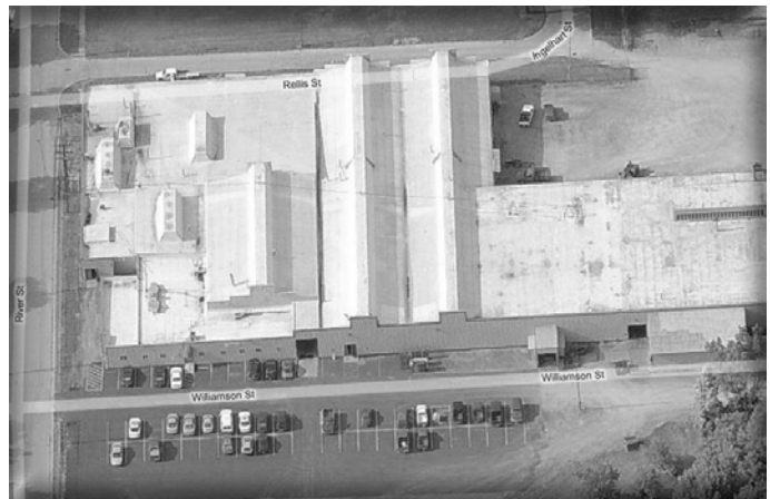
CIGNYS - Saginaw Facility is located at 68 Williamson St. in the City of Saginaw.