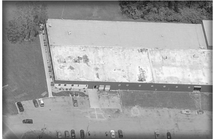
CIGNYS - Bridgeport Facility is located at 5763 Dixie Highway in Bridgeport Charter Township.

In 2009 the manufacturer invested nearly $1 million in its Bridgeport and Shields locations.