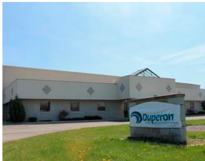
Duperon Corporation's new facility is located at 1200 Leon Scott St. in the City of Saginaw.