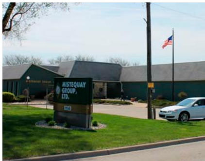
Mistequay Group Ltd. headquarters are located at 1156 N. Niagara St. in the City of Saginaw

In 2010, Duperon grew 37% and saw growth of 26% in 2011. The Leon Scott facility is 74,000 sq. ft. and the company plans to add office space with a total of investment of over $2.5 million. Duperon had 14 employees in 2007 and has 50 employees today, with plans to hire an additional five in the near future. The company was recently named a 'Michigan 50 Companies to Watch' by the Edward Lowes Foundation.