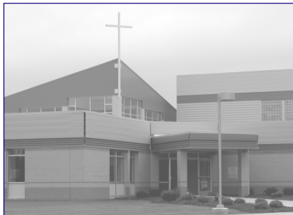
Peace Lutheran's new $8.1 million facility.

Saginaw Future assisted Peace Lutheran in securing Industrial Revenue Bond financing for the project.