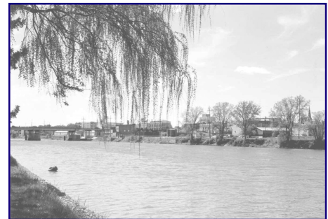
Proposed future site of west side park.

development projects, the City of Saginaw completed dredging of the Rust Avenue boat launch in late 2002. The dredging has greatly improved current boat access along the Saginaw River.