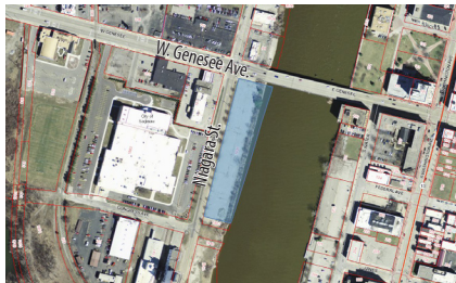
The trail addition is located at 1920 N. Niagara across the street from Saginaw Arts & Sciences Academy and stretches from W. Genesee to Congress.

An easement on a Saginaw School District property along N. Niagara was approved by the School District and City Council that will benefit a long-term effort to build a trail network along both banks of the Saginaw River. The unused parking lot at 1920 N. Niagara is located across the street from Saginaw Arts & Sciences Academy. The Saginaw Riverfront Commission will coordinate a plan to replace the lot with an open grassy area and remove all barriers blocking the view of the river. The ultimate goal is to tie the trail with the Saginaw County Rail Trail and the Great Lakes Bay Regional Trail.