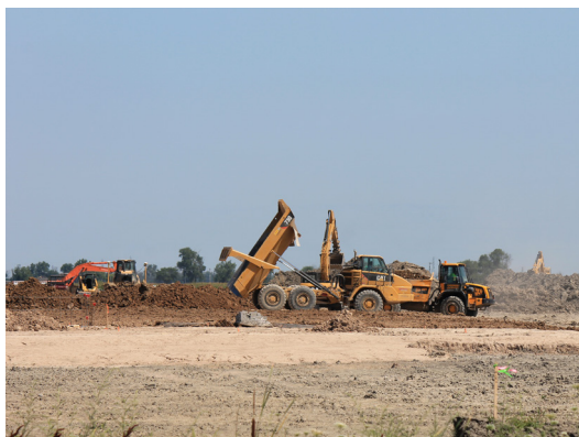
The FedEx Ground distribution center is located on M-81 in Buena Vista Charter Township, just east of the Buena Vista Commerce Centre.