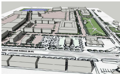
Rendering of the Buena Vista Town Center located at 3235 Holland Ave. in Buena Vista Charter Township.

Use your smartphone QR-Code scanner to learn more about Saginaw Future!