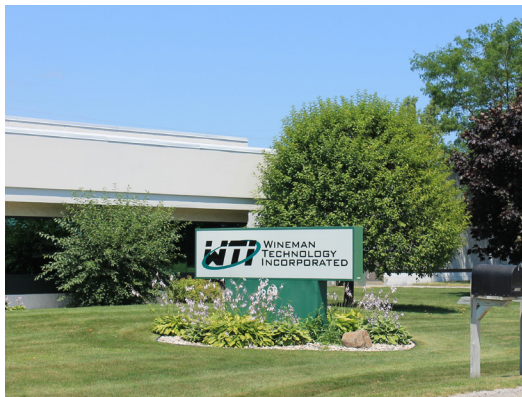
Wineman Technology, Inc. is located at 1668 Champagne Dr. N in Kochville Township.

The much-anticipated Riverview Brownstones on Hamilton St., located in Old Town Saginaw, broke ground in July. Go to www.riverviewbrownstones.com for more info.