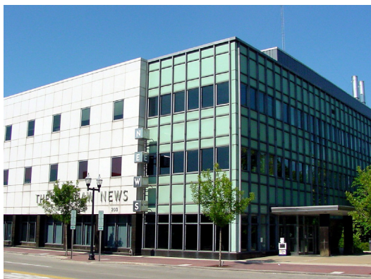
SVRC Industries and the Downtown Saginaw Farmers Market will be located at 203 S. Washington Ave. in Downtown Saginaw.

The FedEx center is expected to employ 117 full and part time positions, with a majority of these positions (18 full time and 68 part time) retained from the current Buena Vista location. The company expects to invest nearly $20.3 million in the new facility and equipment, including a state-of-the-art material handling system. Saginaw Future is assisting the company and Buena Vista community with an abatement on real property improvements. SFI also assisted with site location and development with the property owner and a commercial realtor, who represented FedEx.