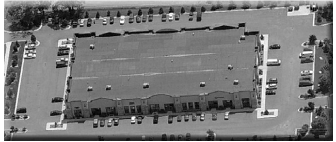
Midwest Reprocessing Center is located at 3995 Fashion Square Blvd.

Saginaw Future assisted the new company and Saginaw Charter Township with an investment incentive for the project that will provide good paying jobs. In addition, the MEDC provided a training grant through its diversification program for Troy-based CJPS Enterprises to provide critical business, strategic, and marketing assistance to MRC.