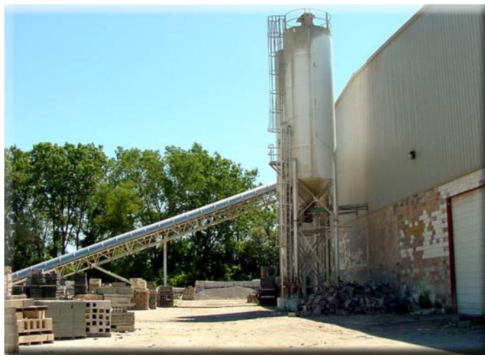
Midwest Manufacturing is located at 1808 Veterans Memorial Parkway in the City of Saginaw.

Midwest Manufacturing has become one of the largest manufacturers of building materials in the Midwest. www.midwestmanufacturing.com