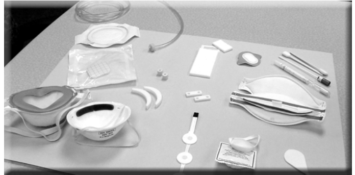
Filtrona Porous Technologies are found in writing instruments, printer cartridges, medical instruments, surgical devices and more.

Filtrona Porous Technologies is an international, market leading, specialty plastic and fiber products supplier listed on the London Stock Exchange. Formerly Lendell Manufacturing, the company was acquired in October 2009 by Filtrona PLC and became Filtrona Porous Technologies.