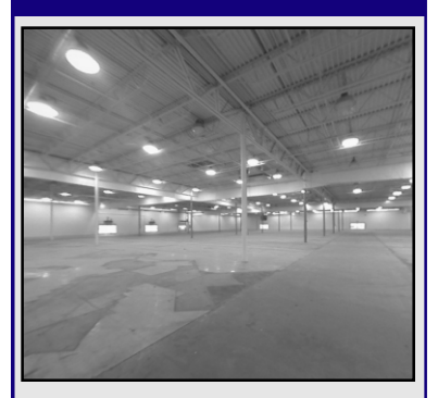
Former Builder's Square on 3175 Westbay, 109,800 sq. ft.

In 2002, Saginaw Future received a high-tech Excelerator grant from SBC to produce 360 degree Virtual Property Tours. The property tours allow Internet computer users to virtually explore the interior of buildings for sale or lease.