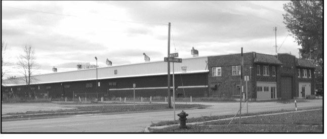
IQC's proposed expansion on E. Holland Ave. in Saginaw.

International Quality Control (IQC) is a relatively new company, which began operations in 2001. Its initial success has led to a recent expansion. IQC is continuing to expand and is the process