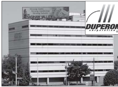
Duperon Corporation headquarters are located in the Saginaw Commerce Tower at 515 N. Washington Ave.

Duperon has contracts with private sector clients like Campbell's Soup and California wineries, while the majority of its clients are utilities, municipalities and governmental agencies.