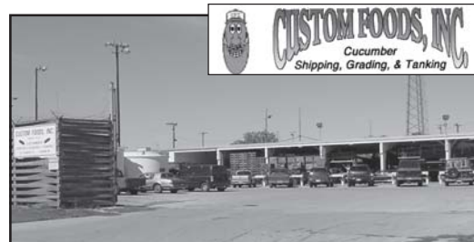
Custom Foods Inc. is located at 634 Kendrick St. in the city of Saginaw.

Besides its 14 full-time employees, Custom Foods takes on approximately 100 seasonal employees, often times hiring students and others who rely on