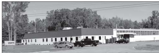
The Cignys - Bridgeport Facility, formerly Shear Tool, is located at 5763 Dixie Highway.

The Cignys - Bridgeport Facility, along with Saginaw Products and Saginaw Caster & Wheel in the city of Saginaw, and Shields Manufacturing in Thomas Township, are divisions of the Cignys Corporation.