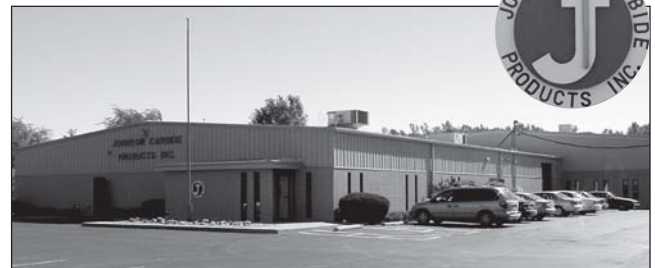
Johnson Carbide Products, Inc. is located at 1422 S. 25th St. in Buena Vista Charter Township.

Established in 1953, Johnson Carbide employs approximately 54 people and also had a $1 million expansion in 2000.