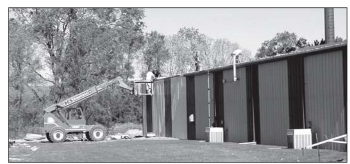
Allied Tool & Machine Co.'s expansion project included adding more manufacturing space.

Corporation, The Dow Chemical Company and Superior Industries. Allied Tool & Machine received the 1998 Quality Supplier of the Year from the Hemlock Semiconductor Corporation.