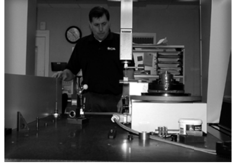
InCal Technologies is located at 3870 E. Washington in Buena Vista Charter Township.

InCal Technologies purchased new equipment to expand its calibration and inspection capabilities. Computer equipment, accessories and software upgrades necessary for keeping pace with changing technology were also added.