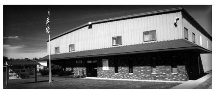
Chesaning Manufacturing is located at 307 S. 4th St. in the Village of Chesaning.

Chesaning Manufacturing Company, Inc. has been producing aerospace tooling and test equipment for over 45 years. The company recently became one of five preferred General Electric suppliers.