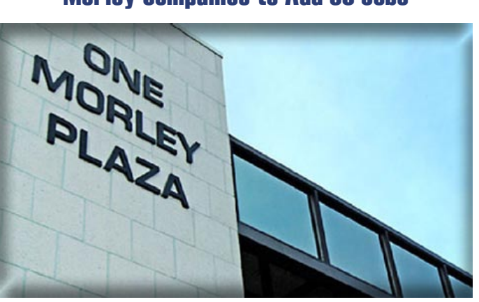
Morlev Companies. Inc. is located at One Morlev Plaza in Saginaw Charter Township.

The Michigan Economic Development Corporation (MEDC) and Saginaw Future Inc. (SFI) are proud to support a major expansion project at Morley Companies, Inc.