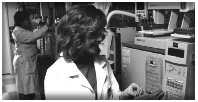
Dow Corning Corporation HIMS is located at 1635 N. Gleaner Rd. in Thomas Township.

Dow Corning Corporation invested $1.16 million in its Health Industries Materials Site (HIMS) in Thomas Township. The project includes construction of a nitrogen pipeline between Hemlock Semiconductor Corporation and HIMS, eliminating the need for tanker deliveries.