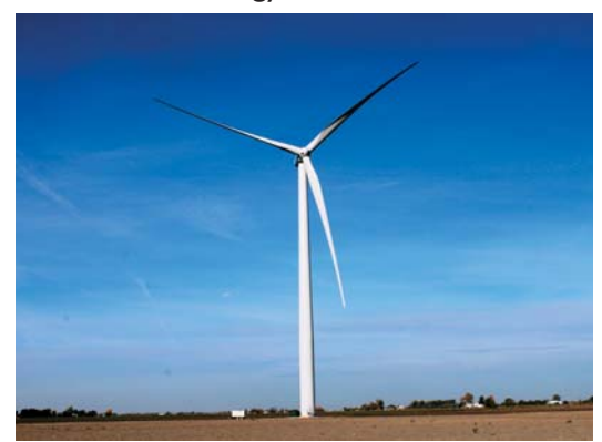
NextEra Energy Resources has seven new wind turbines located in Blumfield Twp and an operations building on N. Gera Rd.

NextEra Energy Resources, a subsidiary of NextEra Energy, Inc., is North America's largest producer of wind energy, with more than 90 wind facilities in operation in 17 states and Canada. The company has constructed seven wind turbines and an operations building in Blumfield Township for a combined investment of $20 million. It is part of a $230 million, 75-turbine, Tuscola Bay Wind Energy Center in Saginaw, Bay and Tuscola Counties, which will produce enough electricity to power about 50,000 homes. The project required 220 construction workers, will employ 10 technicians and will be completed by the end of 2012.