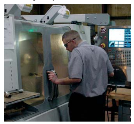
Saginaw Products Corp. has locations in Bridgeport Twp., City of Saginaw and Swan Creek Twp.

Saginaw Products Corp. (formerly CIGNYS Corporation) continues to invest at its Bridgeport Charter Township and Shields locations. The company purchased a new mill for its Bridgeport site, which is the fourth investment in the past four years for a total of more than $2 million. A third investment in three years at the Shields site will total nearly $900,000. New equipment purchases will provide increased efficiency, technology and the ability to service additional customers. Founded in 1919, Saginaw Product is ISO 9001:2000 Registered: AS9100 Registered and ITAR (International Traffic in Arms Regulations) Registered.