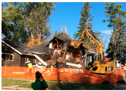
The first of 950 blighted houses to be demolished or acquired in the City of Saginaw.