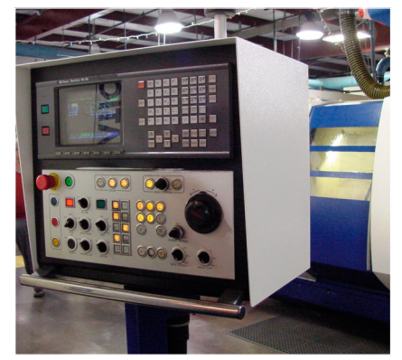
Fullerton Tool Company is located at 121 Perry St. in the City of Saginaw.

Fullerton Tool Company continues to invest in technology and add to its growing workforce. The company recently hired 15 new employees and purchased new machinery valued at $2 million. Fullerton Tool has been family-owned for over 70 years and manufactures solid carbide cutting tools for a vast variety of industries, including aerospace, firearms, medical, automotive, heavy equipment and more. The City of Saginaw-based company is ISO 9001:2008 certified and also invested $1.4 million in 2012.