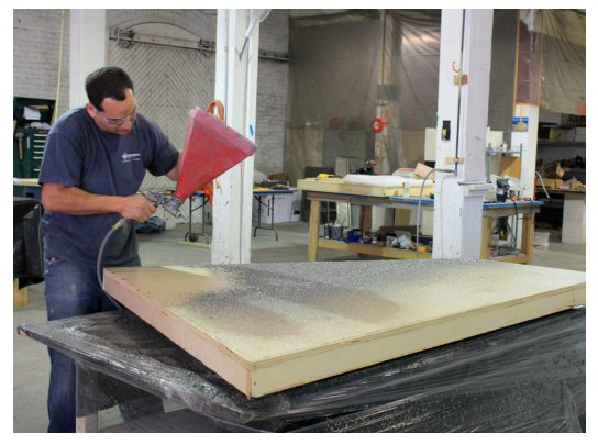
A Niche Design technician layers synthetic material on panels for the 9/11 Memorial to be installed at the World Trade Center site.

Niche Design specializes in custom millwork design and engineering for transportation, hospitality, sporting venues, museum exhibit displays and custom residential casework. The company was leasing a facility in the City of Saginaw and was seeking assistance to purchase it. SFI worked with the City of Saginaw to remediate zoning and assessment issues and Niche was able to acquire the facility that houses its 15-person staff. The design company fabricates functional interactive spaces for commercial environments such as airport and airline ticket counter stations, electronic ticketing kiosks and security stations.