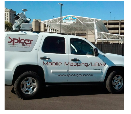
Spicer Group, Inc.'s Mobile Mapping System allows for rapid collection of data for asset management.

Engineering firm Spicer Group, Inc. purchased a mobile lidar system, which is a remote sensing technology that measures distance by illuminating a target with a laser and analyzing the reflected light. The total project investment was over $700,000 and will result in the creation of 10 jobs. Using the Leica Pegasus Mobile Mapping System, Spicer is now offering mobile mapping services nationwide and is the first firm in North America to offer these services. The key benefits of the system include survey-grade accuracy, 360° image coverage, reducing the need for traffic control measures, the unit can be mounted on all types of vehicles and more.