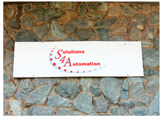
Solutions 4 Automation is located at 2124 S. Michigan Ave. in the City of Saginaw.

Solutions 4 Automation is a designer and builder of custom automation and test equipment that recently invested in new CNC equipment. The company began with two employees and has grown to 24. Solutions first leased the former Dial Tent & Awning building on S. Michigan Ave., purchased it in 2011 and has made substantial improvements to its interior. SFI assisted the company and the community with the creation of an Industrial Development District in 2011 and most recently with a tax abatement application for its new CNC machinery.