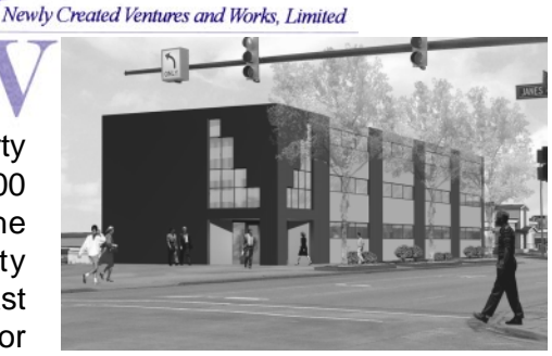
Rendering of proposed renovation.

The plan calls for new lighting, carpeting, paint and bathroom renovations of the interior. NCVW plans to install a new roof and paint the exterior of the