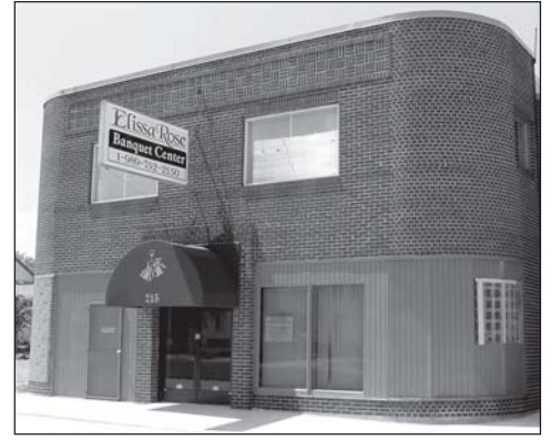
The Elissa Rose Banquet Center is located on 215 N. Park St. in the City of Saginaw.