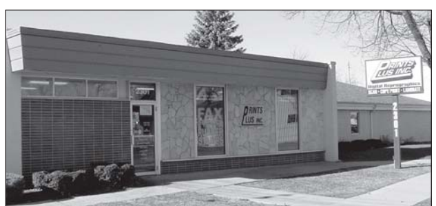
Prints Plus Inc. is located at 2301 N. Michigan Ave. in the City of Saginaw.

The 17-year-old company specializes in large format commercial printing.