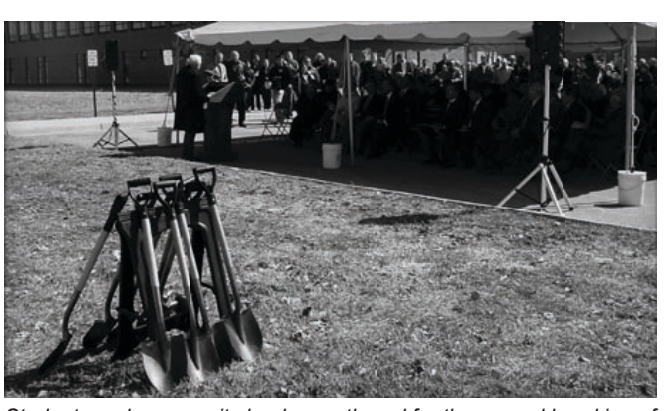
Students and community leaders gathered for the ground breaking of the new SVSU College of Nursing and Health Sciences building.

The College of Nursing and Health Sciences will house the schools of nursing, occupational therapy, kinesiology and social work. Construction of the stateof-the-art facility is underway, and the laboratory and classroom facility may open in the summer of 2010. "About 2,000 SVSU students are enrolled in health-