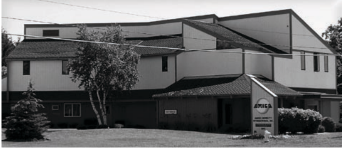
Amigo Mobility International, Inc. is located at 6693 Dixie Highway in Bridgeport Charter Township.

Amigo Mobility International, Inc. based in Bridgeport Charter Township, recently added 20,000 sq. ft. and new equipment. Amigo invested more than $750,000 and created six new jobs as a direct result of the expansion.