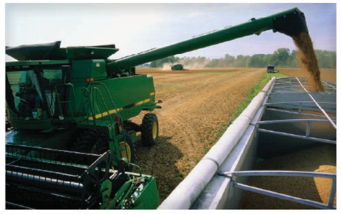
Star of the West Milling Co. headquarters are located at 121 E. Tuscola St. in the City of Frankenmuth.

Star of the West Milling Co. is expanding its Frankenmuth Township facilities, adding 312,000 bushels of additional storage and a grain dryer.