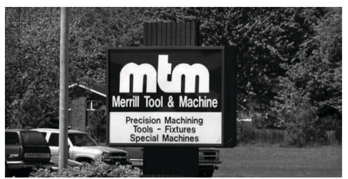
Merrill Tool & Machine, Inc. is located at 21659 W. Gratiot Rd. in the Village of Merrill.

Merrill Engineering & Integration (formerly Merritech), is a machine build facility that was established in 1978 to expand in engineering and assembly.