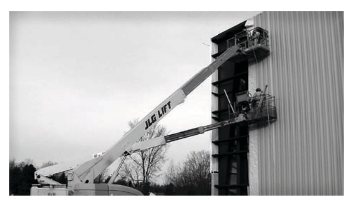
The Merrill Tool & Machine location expanded by 20,000 sq. ft. in 2005.

The company has expanded several times over the past five years and currently employs 450 people in the region. Officials anticipate hiring 10 more employees, because of the new investment.