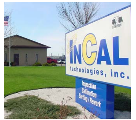
InCal Technologies, Inc. is located at 3870 E. Washington Rd. in Buena Vista Charter Township.

InCal Technologies, Inc. expanded for the third time in two years. The company added over $60,000 in new equipment to its inspection and calibration department.