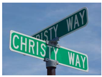
Kapex Manufacturing LLC is located on Christy Way in Saginaw Charter Township.

With approximately 12,000 sq. ft. at the new location, the company will have the space and capabilities for large-scale projects and mobile interactive spaces, in addition to everyday projects. ZENTX will invest a total of $1 million and add three new positions.