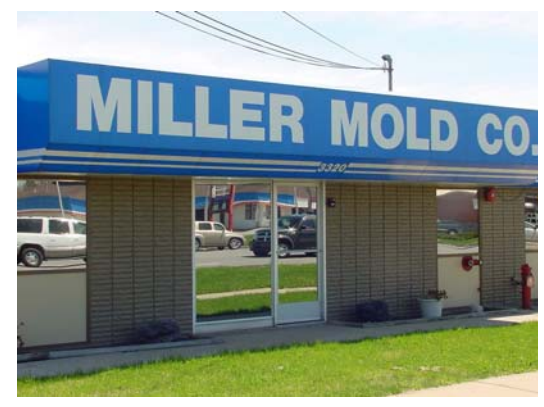
Miller Mold Co. is located at 3320 Bay Rd. in Saginaw Charter Township.

Miller Mold Co. is a Saginaw Charter Township company that manufactures aluminum molds and dies, as well as special tooling for the thermoform plastics industry. Miller Mold invested nearly $310,000 that will create up to five new jobs.