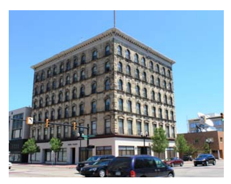
The Eddy Building is located at 100 N. Washington Ave. in Downtown Saginaw.

Above - The Bancroft Building is located at 107 S. Washington Ave. in Downtown Saginaw.