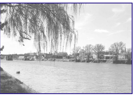
Proposed future site of west side park.

development projects, the City of Saginaw completed dredging of the Rust Avenue boat launch in late 2002. The dredging has greatly improved current boat access along the Saginaw River.