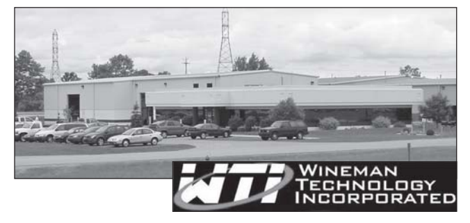
Wineman Technology Inc. is located on 1668 Champagne Drive, N. in Saginaw Township.

This expansion will allow WTI to continually increase capacity in order to better meet the growing needs of its customers.