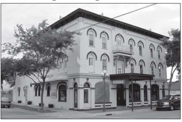
Perry's Schuch Hotel is located on 301 N. Hamilton St. in Old Saginaw City.

Perry invested $500,000 in the project and will hire