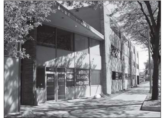
The Sedona Building is located at 310 S. Washington Ave. in Downtown Saginaw.