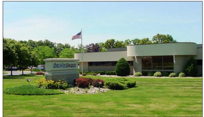
Orchid Unique Orthopedic Solutions is located at 6688 Dixie Highway in Bridgeport Charter Township.

Orchid Unique Orthopedic Solutions is a single-source manufacturer of surgical cutting accessories, instruments and implants. The company recently invested $3.5 million to consolidate operations and expand its facility in Bridgeport Charter Township.