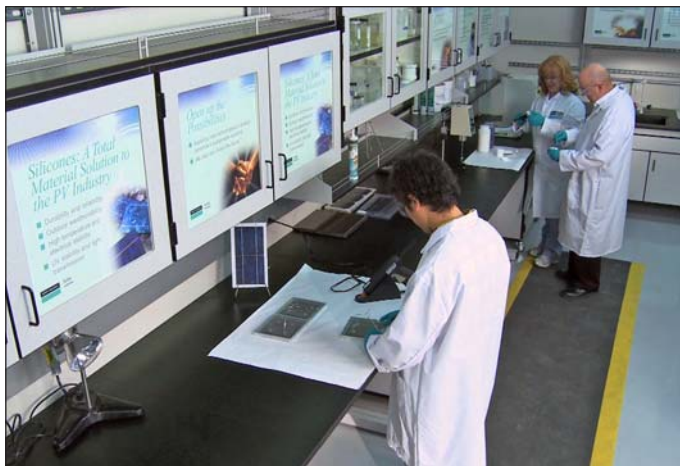
The Dow Corning Solar Solutions Application Center is located at 10200 Hercules Dr., in Freeland.