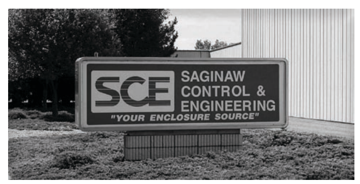
Saginaw Control & Engineering, Inc. is located at 95 Midland Rd. in Saginaw Charter Township

Saginaw Control & Engineering (SCE) will add at least four jobs to its ranks upon the installation of a $430,000 welding machine.