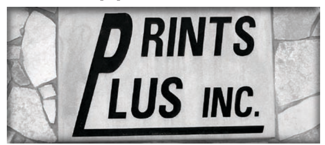
Prints Plus is located at 2301 N. Michigan Ave. in the City of Saginaw.

Prints Plus Inc. located in the City of Saginaw has invested in new equipment to expand its capabilities.