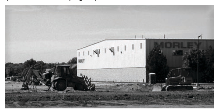
Construction at Morley Companies has already started.

The 32,750 sq. ft. facility will house a call center and a training area, where employees provide data collection and market research, along with call center services. Morley has two existing office buildings and a warehouse on the site.