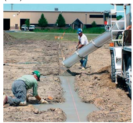
Footings are being poured for the new Saginaw Pattern building in Kochville Township.

Saginaw Pattern is an automotive Tier I supplier of aluminum molds for foam seats, head rests, arm rests and other foam products for the automotive industry. A majority of products are exported to Europe, Mexico and Canada.