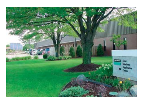
Dow Corning Corporation Solar Solutions Applications Center is located at 10330 Hercules Dr. in Freeland.