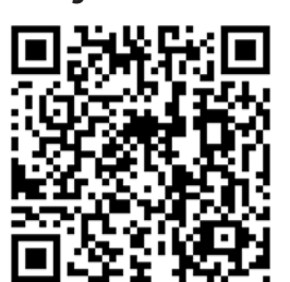
Use your smartphone QR-Code scanner to learn more about Saginaw Future!

The Great Lakes Bay Regional Alliance hosted its first regional progress update at the Midland Center for the Arts, to promote its brand and to welcome it newest member, Isabella County. Regional collaboration was highlighted, including the $48 million passenger terminal at MBS International Airport, which is expected to open in 2013. Regional organizations had display booths to inform attendees on numerous developments, from economic growth to tourism.