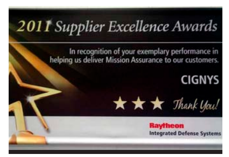
CIGNYS has locations in Bridgeport Charter Twp., City of Saginaw and Thomas Twp., MI.