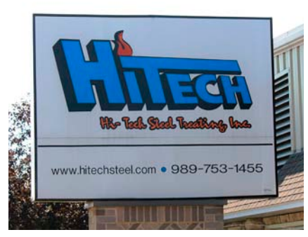
Hi-Tech Steel Treating, Inc. is located at 2720 Roberts St. in the City of Saginaw.

Hi-Tech Steel Treating, Inc. invested more than $280,000 for additional equipment and created two new jobs as a result of the project. The City of Saginawbased company currently employs 80 employees with 53 of those being City residents. Established in 1984, Hi-Tech Steel provides heat treating services, such as Annealing, Carbonitriding, Flame Hardening, Induction Hardening, Neutral Hardening, Stress Relieving, Steam Treating, Deep Freezing, Straightening, Rotary Furnace Line, Vacuum Ferritic Nitro Carburizing, and more. The company is ISO 9001:2008. registered and has a second location in Tennessee.