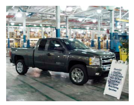
General Motors - Saginaw Metal Casting Operations is located at 1629 N. Washington Ave. in the City of Saginaw.