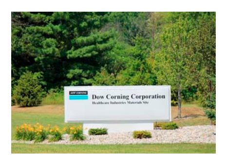
Dow Corning Corporation HIMS is located at 1635 N. Gleaner Rd. in Thomas Township.