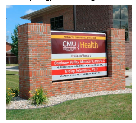
The CMU Medical Education Partners is located at 912 S. Washington Ave. in the City of Saginaw.

The Michigan Strategic Fund recently approved the transfer of the Redevelopment Renaissance Zone designation from Midwestern Surgical Associates, P.C. to the Central Michigan University (CMU) Medical Education Partners, which operates as the surgical department for the new CMU College of Medicine. The Education Partners, with 37 employees, is located at 912 S. Washington Ave., which is a 22,000 sq. ft. facility in the City of Saginaw. The transfer is effective for the remainder of the term ending December 30, 2020.