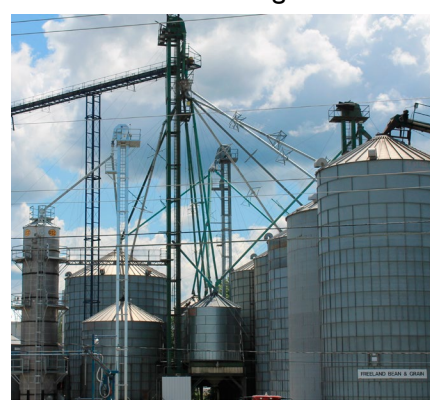
Freeland Bean and Grain, Inc. is located 1000 E. Washington St. in Tittabawassee Township.

Freeland Bean and Grain, Inc. constructed a large storage facility that will house a dryer and conveyor system at its 1000 E. Washington headquarters in Tittabawassee Township. The more than $300,000 investment will allow for additional process capacity and create approximately three jobs. Freeland Bean and Grain specializes in country grain and edible elevator storage, retail fertilizer and is a crop input dealer. Saginaw Future has worked with the family owned and run agri-business for a number of years. SFI assisted the company, which was established in 1983, and the Tittabawassee community with a tax incentive.