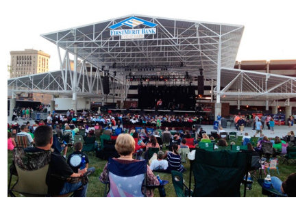
The FirstMerit Bank Event Park is located at 300 Johnson St. in Downtown Saginaw.