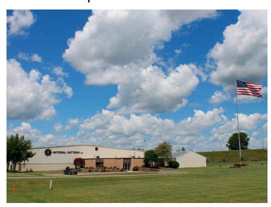
National Pattern, Inc. is located at 5900 Sherman Rd. in the City of Zilwaukee's Bridgeview Center Industrial Park.

National Pattern, Inc., located in the Bridgeview Center Industrial Park, assists customers in the development of new casting processes and techniques. Its innovative computer system insures that its capabilities are flexible and powerful enough to initiate any design. The company purchased new CNC equipment to increase production volumes to meet customer demands and reduce costs. National Pattern reinvests to remain on the leading edge of tooling technology and also has a well-established apprenticeship program. SFI assisted the company and the Zilwaukee community with a tax incentive.