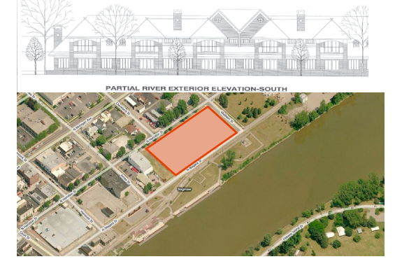
The new condominium project will be located at 406 Hamilton St. on the Saginaw Riverfront across from Ojibway Island.

In March 2014 a new law was signed to extend the Renaissance Zone benefit for Saginaw's first market rate condominium project. Recently approved by the Michigan Strategic Fund, the 30-unit, $3.62 million development will be located on Hamilton St. across from Ojibway Island and contain 3,000 sq. ft. of commercial space. The property was a former vacant manufacturing site, that did not generate property taxes. With the 15-year Renaissance Zone extension, developers will pass along the tax-free status to the condominium purchasers.