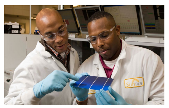
Suniva, Inc. is opening a second U.S. manufacturing facility, which will be located at 2650 Schust in Saginaw Charter Township.