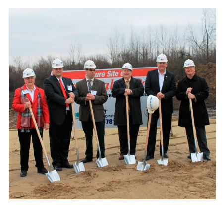
Great Lakes PACE is located at 3200 Fashion Square Blvd. in Saginaw Charter Township.

The A&D Charitable Foundation is building a 20,000 sq. ft. all-inclusive elder care facility in Saginaw Charter Township. The new Great Lakes PACE center will be located at 3200 Fashion Square Blvd. PACE stands for Programs of All-inclusive Care for the Elderly, and is an alternative to nursing home living, enabling the elderly to remain in their homes. Total investment in the facility is $3.5 million, which will create 60 jobs. Great Lakes PACE will provide services on site including; a pharmacy, lab, physical and occupational therapy facilities, meals, multipurpose rooms and transportation.