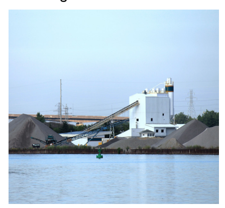
Sargent Docks & Terminal Inc. is located at 5606 N. Westervelt Rd. in the City of Zilwaukee.

Sargent Docks & Terminal is investing over two million dollars in upgrading its rail yard. The company is installing a new rail spur, which will allow for whole unit train access. The addition will greatly reduce the cost of shipping for Sargent Docks and its customers. The company provides bulk construction and agricultural materials by ship, rail and truck. The project was made possible by a grant from the Michigan Department of Transportation that will cover 50% of the cost of installing the new rail line. Sargent will hire two new employees as a result of the investment, with many more hires anticipated in the near future.