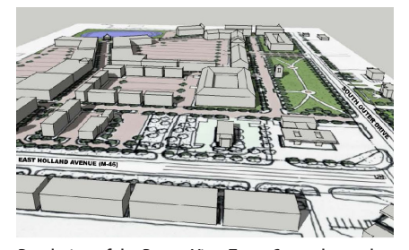
Rendering of the Buena Vista Town Center located at 3235 Holland Ave. in Buena Vista Charter Township.

Use your smartphone QR-Code scanner to learn more about Saginaw Future!