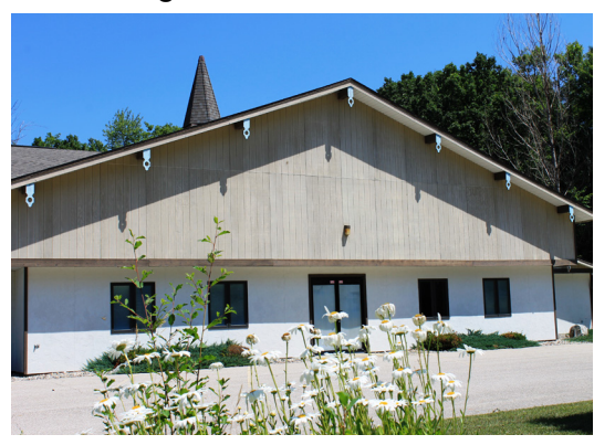
Michigan Brand, Inc.'s second facility is located at 320 Heinlein Strasse in the City of Frankenmuth.

Michigan Brand, Inc. is a wholesaler and packager of specialty meat products that began in the early 1980's. The company, with a location in Bay City, supplies 32 franchise locations in various states and expects to increase to over 60. The Bay City facility had reached capacity, so the company added a second location in the City of Frankenmuth that was already FDA certified. Total investment is expected to be $4.8 million and 94 jobs will be created, with support from the MEDC Business Development Fund, financing and a tax abatement.