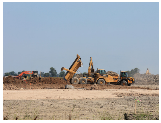
The FedEx Ground distribution center is located on M-81 in Buena Vista Charter Township, just east of the Buena Vista Commerce Centre.