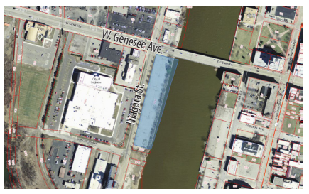
The trail addition is located at 1920 N. Niagara across the street from Saginaw Arts & Sciences Academy and stretches from W. Genesee to Congress.