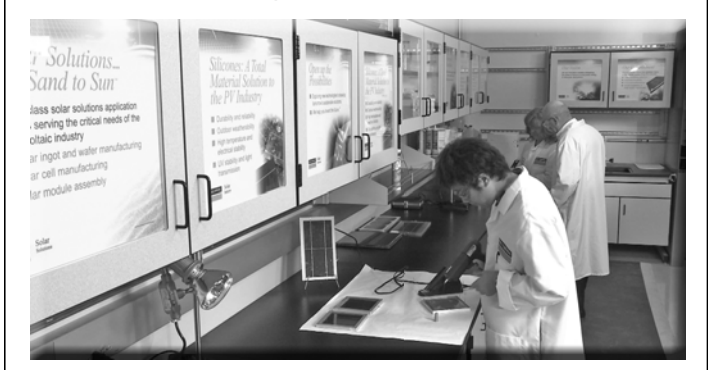
Dow Corning Corporation's Solar Solutions Applications Center is located at 10330 Hercules Dr. in Tittabawassee Township.

Dow Corning Corp. continues to advance itself as a significant supplier within the solar industry. The company has made numerous investments at its Solar Solutions Applications Center in Tittabawassee Township.