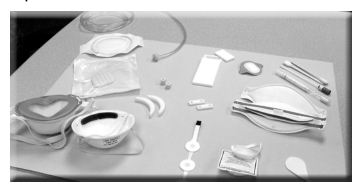
Filtrona Porous Technologies are found in writing instruments, printer cartridges, medical instruments, surgical devices and more.

Filtrona Porous Technologies is an international, market leading, specialty plastic and fiber products supplier listed on the London Stock Exchange. Formerly Lendell Manufacturing, the company was acquired in October 2009 by Filtrona PLC and became Filtrona Poruous Technologies.