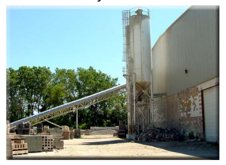
Midwest Manufacturing is located at 1808 Veterans Memorial Parkway in the City of Saginaw.

Midwest Manufacturing has become one of the largest manufacturers of building materials in the Midwest. www.midwestmanufacturing.com